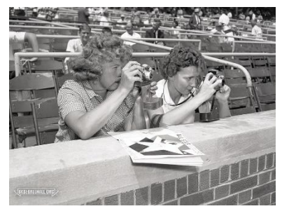
Fans at the All-Star Game by unidentified photographer, July 30, 1962. Courtesy of the National Baseball Hall of Fame and Museum.

The public is invited to meet the student artists at a free reception on Thursday, March 7 from 4 – 6 pm.